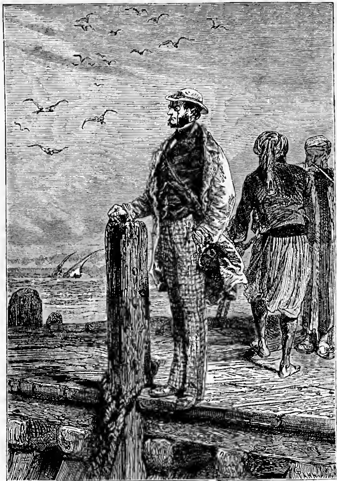
The Inspector of Police.